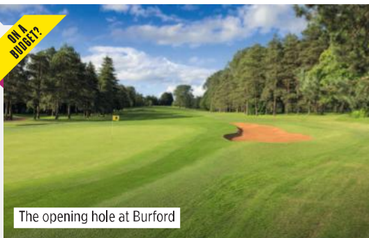
The opening hole at Burford

The course at Burford was designed by JH Taylor, the professional at nearby Frilford Heath, in the mid-1930s. Originally it was without trees, but it's now very different with the holes clearly separated by mature and very attractive woodland. If the walking is easy, the golf is less so. Both length and accuracy are required and there are plenty of bunkers and highly regarded greens. The three par 5s each offer a birdie chance, while the closing three provide a tough finish. W: burfordgolfclub.co.uk GF: Round: £48/£40 after 2pm