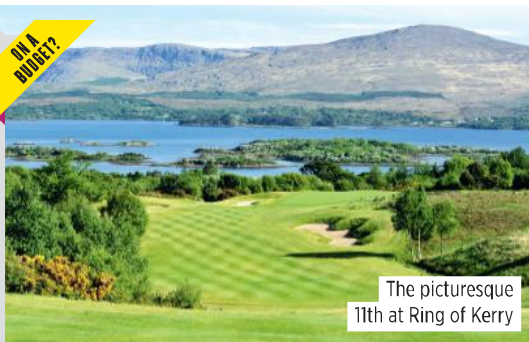
The picturesque 11th at Ring of Kerry