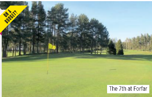
The 7th at Forfar

Angus is a county packed with exceptional golf, and this means that its supporting cast can sometimes be overlooked. There is real strength in depth, with Forfar a fine example of an enjoyable and challenging heathland/tree-lined course. With its rolling, rumples fairways, it has some links-like characteristics, and it has a rich pedigree with Old Tom Morris and James Braid responsible for the design. While no great length, the course is not a pushover. W: forfargolfclub.co.uk GF: Round: £36wd/£39we; Day: £44wd/£49we