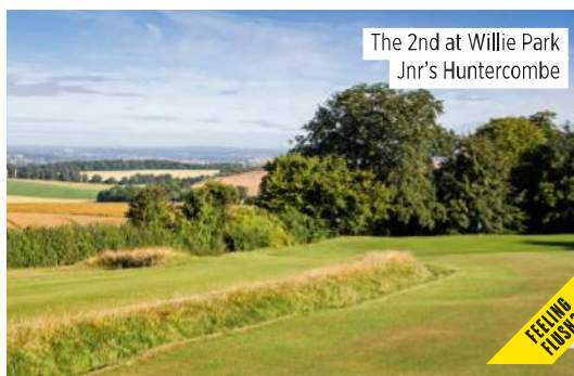
The 2nd at Willie Park Jnr's Huntercombe