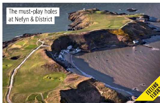
The must-play holes at Nefyn &amp; District