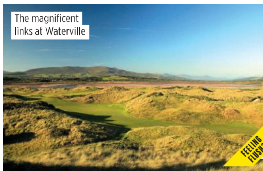
The magnificent links at Waterville